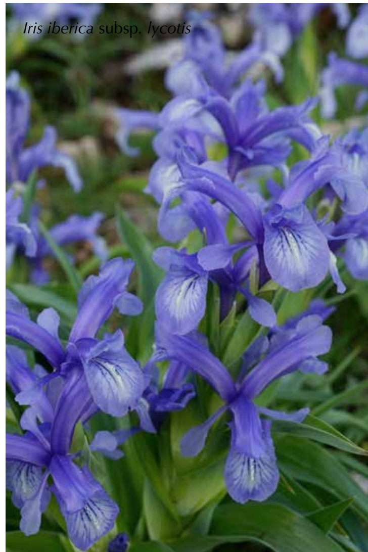
Iris iberica subsp. lycotis

Other junos are more widespread, and few have as great an impact as Iris aucheri which carpets limestone slopes near Gaziantep (and elsewhere) in shades of sky blue to sapphire in spring. In the same area can be found the lovely I. persica , whilst around Cappadocia is I. galatica and in